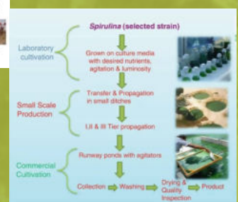
Fig 2: Overall production chart of Spirulina