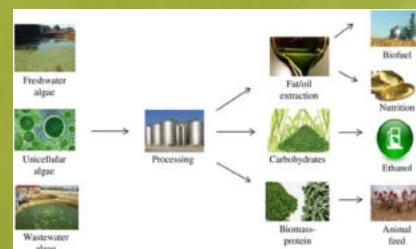
Fig 1: Application of algae in various industries

Spirulina is considered as an excellent food, lacking toxicity and having corrective properties against the pathogenic micro organisms. It lacks cellulose cell walls and therefore do not requires chemical or processing in order to become digestible.