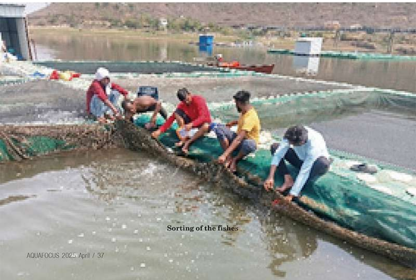
Sorting of the fishes

These foundational tasks have laid the groundwork for an effective and educational demonstration, providing a live model of efficient cage management.