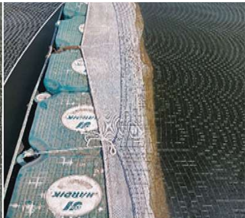
Proper attachment of bird net