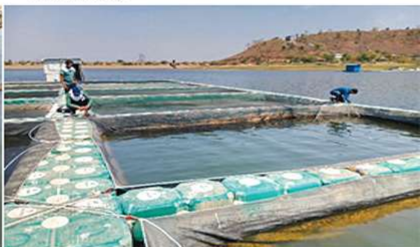
Attachment of bird net