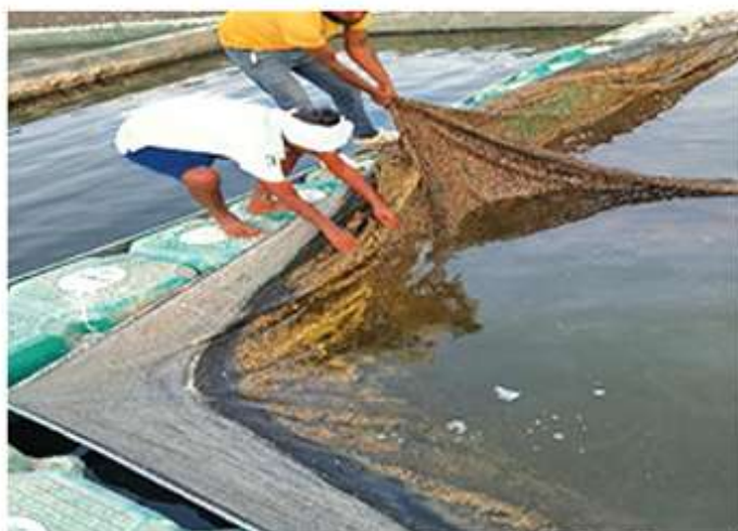
Checking of net before stocking

For more information or support related to cage culture and commercial fish farming, please contact FAITT at info@faiitt.org